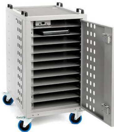
16 Compartment Laptop Trolley