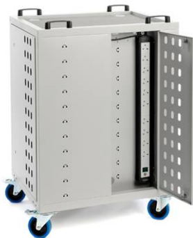
Charging compartment with lockable door.

7 lever mortise safe lock locates through the shelf and back into the 2mm steel cowl.